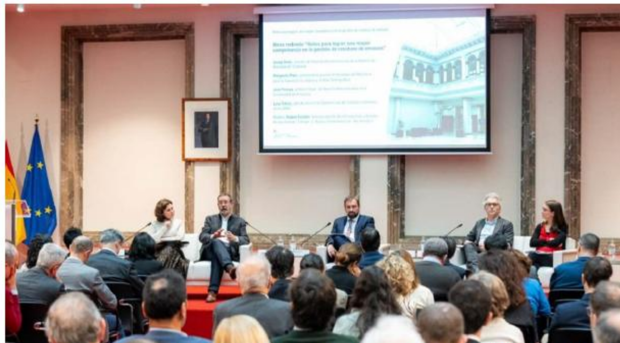
Jornada retos para lograr una mayor competencia en la gestión de residuos de envases